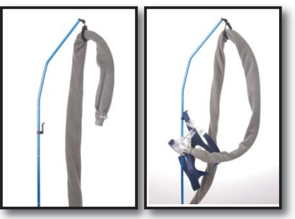
Includes a Hook for your mask to store, out of your way.

A deep socket mast connection, a mast to base <a href="stretched">stretched</a> cord, "tighten-n-lock:" mast to base - provides an even more stable platform, in hose suspension support.