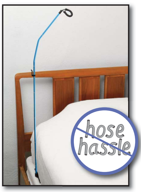
Suspends your CPAP Tubing Overhead, Rotates with sleep movement, and thus, Eliminates the Hose Hassle inherent with All CPAP systems.