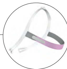
Also comes with Swift™ FX for Her headgear assembly 61543