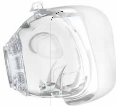
Cushion 62111 (Standard) 62125 (Wide)