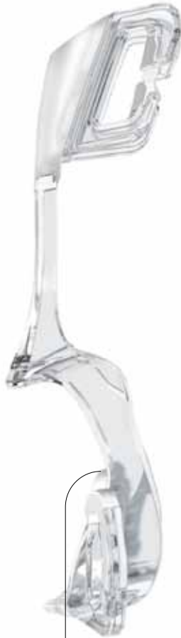
Frame 62113 (Standard) 62127 (Wide)