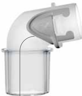
Elbow assembly 62114