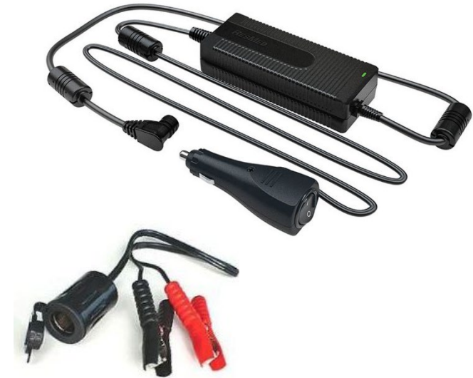
36970 DC/DC Converter Kit

DC/DC Converter 90W allows you to operate your device from a vehicle cigarette lighter socket (12V or 24V DC power source) in a car, boat, or other vehicle equipped with a suitable battery.